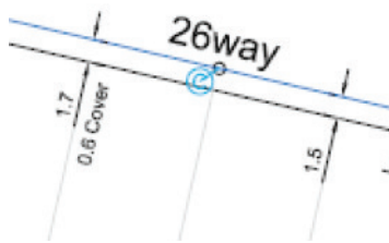
Example of duct dimensions every second boundary line dimensional.